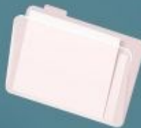
Figure out your evacuation route

Make sure documents such as insurance cards, IDs and other pertinent information are placed in a secured water-proof container.